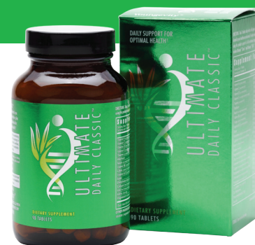
#USYG100084 DIETARY SUPPLEMENT 90 TABLETS

DIRECTIONS: Take 3 tablets daily with a full glass of water, or as directed by your healthcare professional. For best results, we suggest using this product as part of a full nutritional program that also includes Ultimate™ Classic¹ and Ultimate™ EFA¹.